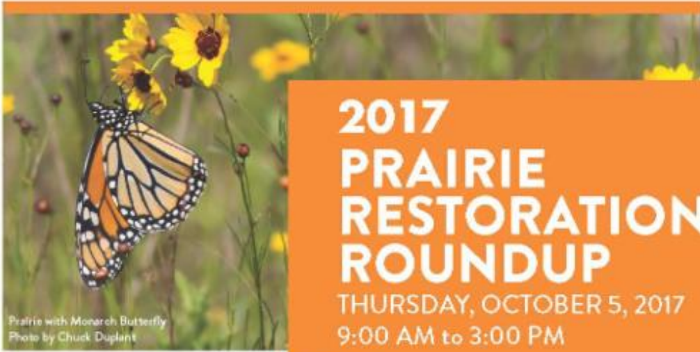
Prairie with Monarch Butterfly