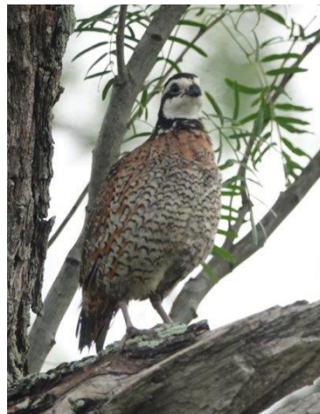
Swainson's Hawk and Northern Bob White Quail.