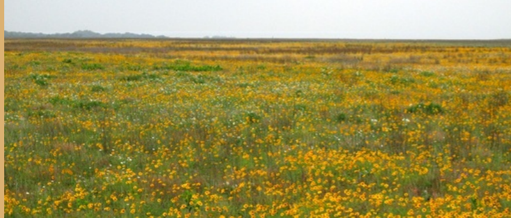
Atwater Prairie Chicken National Wildlife Refuge

JOIN us for "Seed Mixer Social" (Free Seeds will be given away)! We'll discuss how to form an NPAT Chapter, review NPAT's Mission, and talk about the importance of forming partnerships. We'll learn about NPAT's latest Prairie Acquisitions; current & upcoming events!