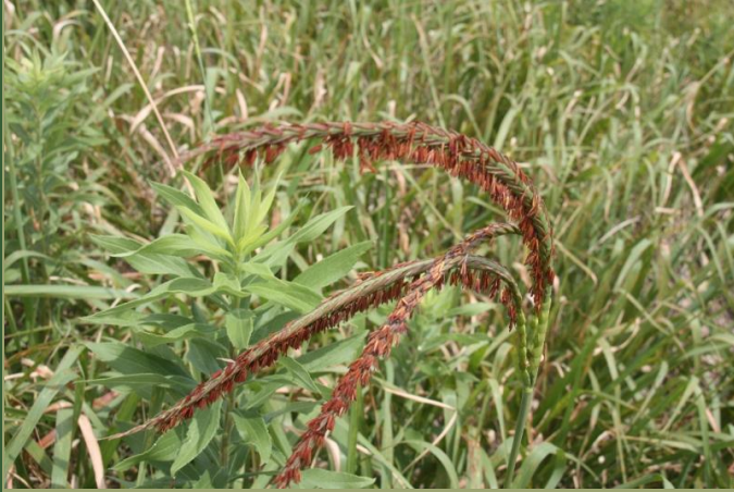
Photo of Eastern Gama Grass on Riesel Prairie by Terri White 06-2017.

It's bordered by farm land on 3 sides and a county road on the other. It has supported many native grasses which define our Texas prairies: Bluestems (big, little, brushy, eastern, spike silver); Indiangrass ; Sideoats grama ; buffalograss ; Texas cupgrass ; dropseed grasses ; and Texas bluegrass . Vines, herbs, and wildflowers have also thrived on this small space from time to time!