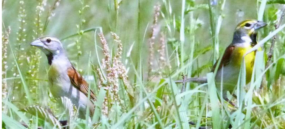
Photo: Dickcissel Female & Male on Mima Mound at Daphne Prairie: Pat Merkord

Stroll across a prairie anytime between late spring and early fall, and you'll rarely be out of ear shot of the dickcissel's distinctive 'trill' , "see-see, dick-dick, ciss-ciss-ciss". Some say they are ' meadow lark look-a-likes ' with a cardinal's stout beak, these birds throng North American grassland habitats, from the prairie pothole region of the Dakotas to the High Plains of Texas, where they feed on seeds and insects.